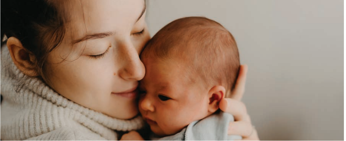
The Eat, Sleep, Console care approach keeps mom and baby together.