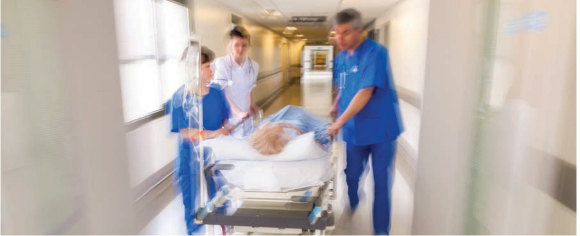
The emergency department offers a time and place to treat opioid use disorder.