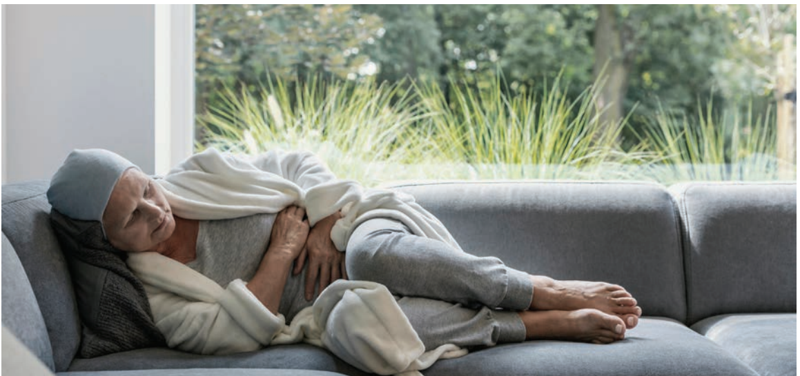
Physical and emotional pain both contribute to the opioid crisis.

HEAL research provides hope for the millions of Americans across the country who need help now.